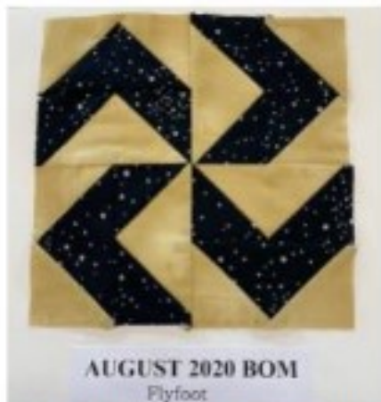
AUGUST 2020 BOM Flyfoot Fabric: Black (dark) & Gold (medium) Sample for 8A – 8B is different Follow cutting for 8B Finish Size 9"