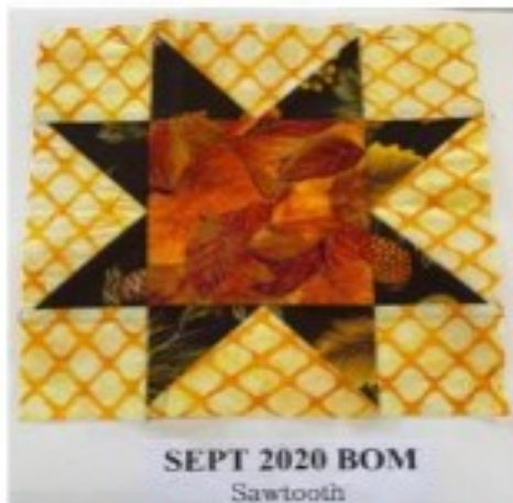
SEPT 2020 BOM Sawtooth Fabric: Fall prints in Dark Lt, Dark Med, & Dark Choose your shades of these colors Finished Size 9"