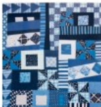
Kitchen Sink Quilting - 1 Day