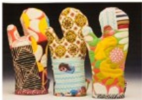
Artful Oven Mitts ½ Day