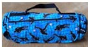
Roll & Go Tote