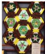
Stars Made Simple