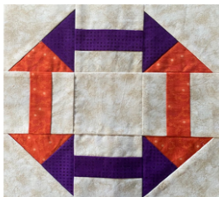
Fabric: Purple, orange, & tan in Dark Light, Medium, and Dark. Finished Size 9"