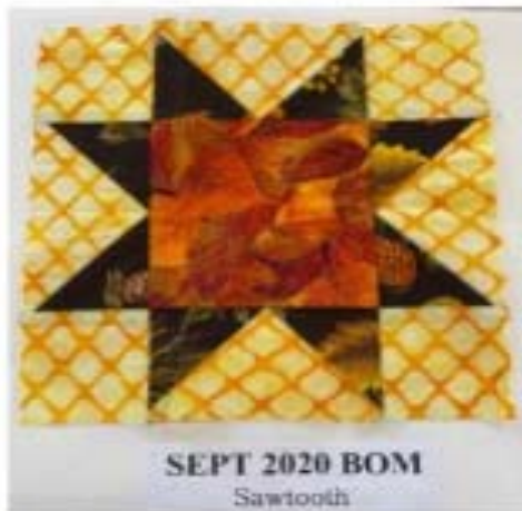
Fabric: Fall prints in Dark Lt, Dark Med, & Dark Choose your shades of these colors Finished Size 9"